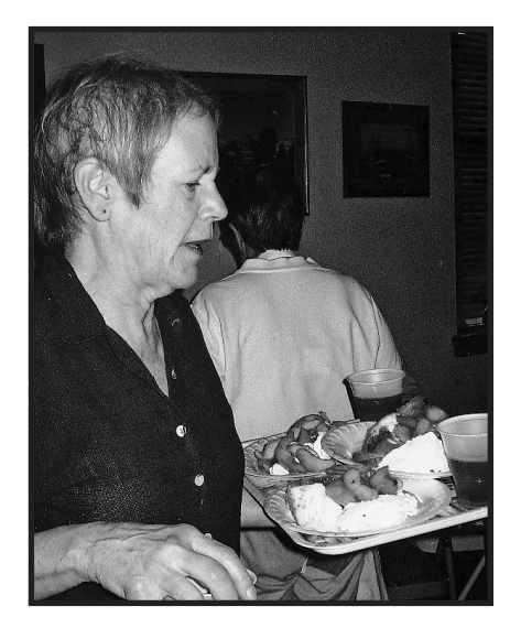
The smiling faces of pleased patrons