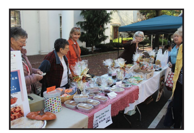
BCHF's Bake Table full of treats was sure to satisfy every sweet tooth