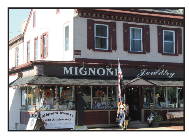
Mignoni Jewelry on Mill Street celebrates an historic anniversary