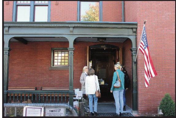
Tours of the Grundy Museum