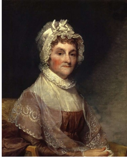
Official portrait of Abigail Adams by Gilbert Stuart.