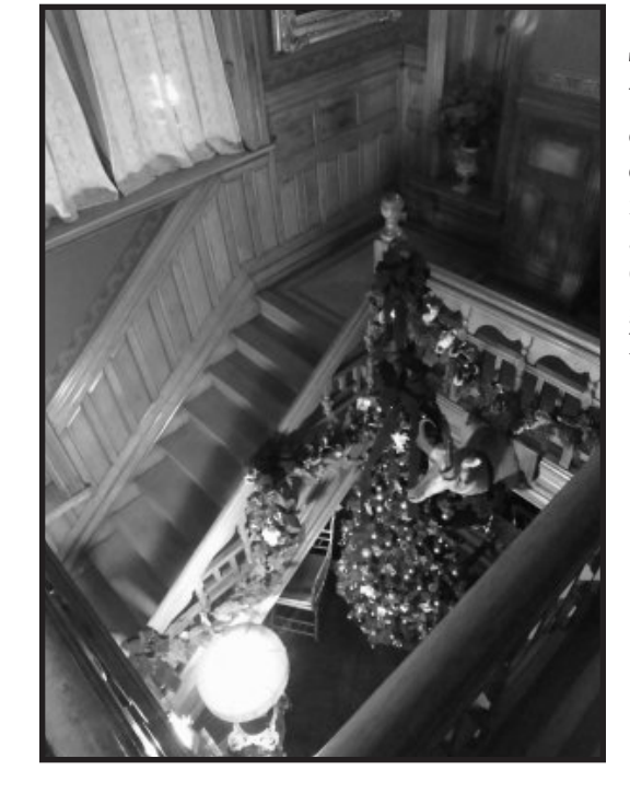
The Entrance Hall With its grand staircase, oak-paneled walls and ceilings, and carved mantle, the entry hall is a space created by the Grundy family to impress guests as they enter the home.