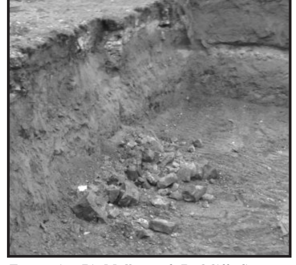
Excavation Pit Mulberry & Radcliffe Streets.

Bristol is situated in the Coastal Plain Physiographic Province. The Coastal Plain is dominated by relatively level landscapes that do not contain mountains and the below-ground material consists of sands, silts, clays, gravels, cobbles, and boulders. Bedrock outcrops are not present in the Coastal Plain. The Coastal Plain was created over millions of years by sediments that were deposited through ancient marine conditions and river delta environments when