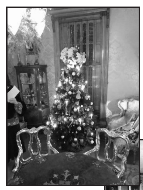
The Drawing Room The decor of the drawing room conveyed to guests that this family was prosperous, educated, cultured, and cosmopolitan.