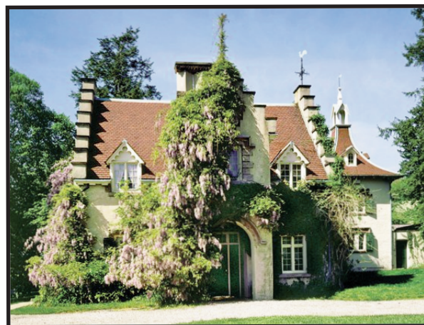
Sunnyside on the Hudson

Then we will tour the Boyertown Museum of Historic Vehicles. Pennsylvania's transportation history will come alive with dozens of displays that include horse-drawn carriages, bikes, cars and trucks, along with roadside architecture such as a 1938 diner and a 1921 Sunoco gas station. Please